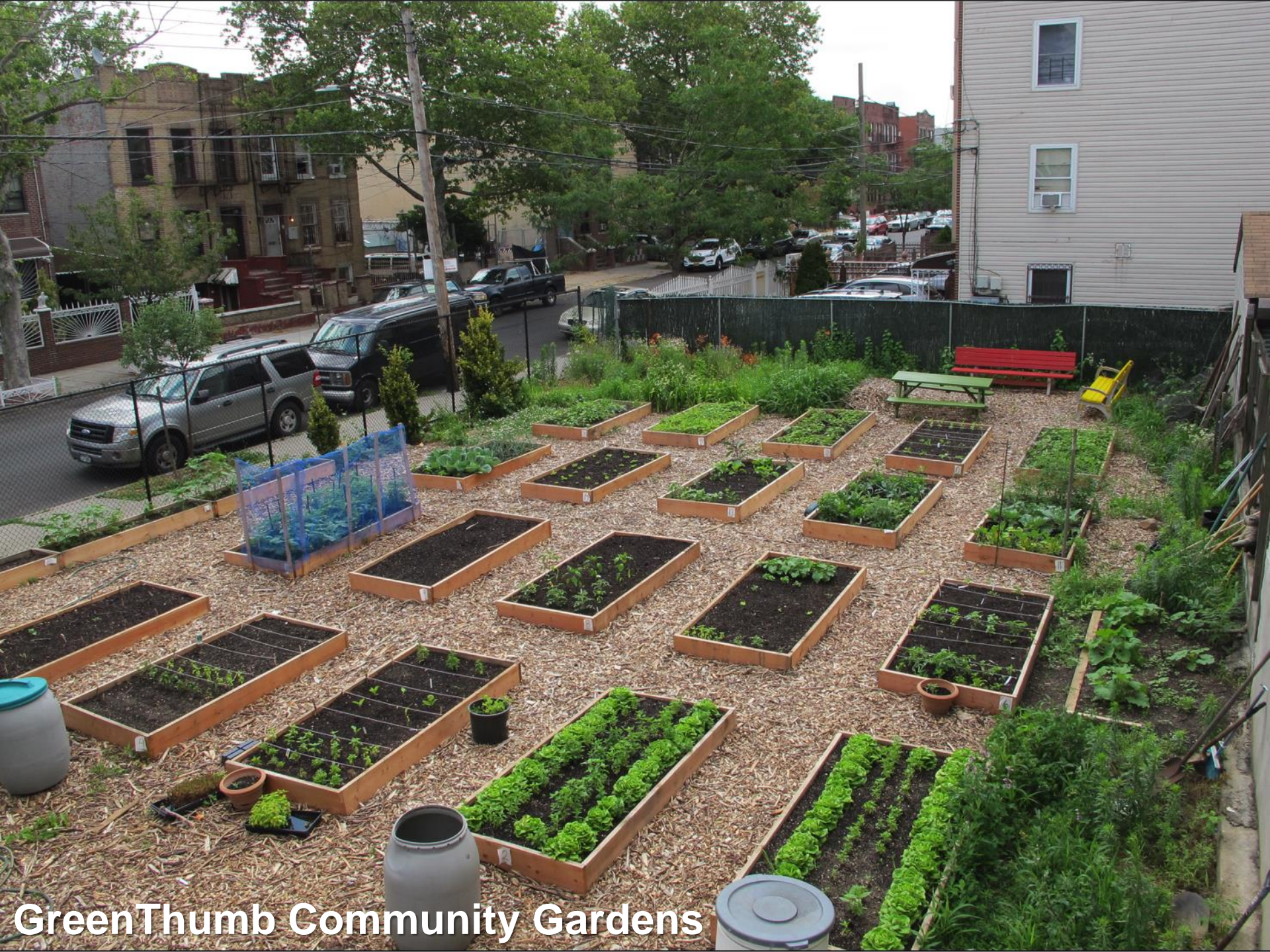
GreenThumb Community Gardens